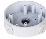
PFA139 Junction Box