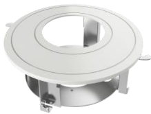
DS-DS-1227ZJ-DM42 In-Ceiling Mount