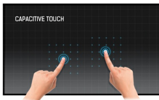
Touch technology - Capacitive

The ProLite TF3215MC-B1 (31.5 inch) uses PCAP touch technology and is built into an eye-catching bezel with edge-to-edge glass. Thanks to a glass overlay covering the screen and a rugged bezel, it guarantees high durability and scratch-resistance, making it perfect for kiosk and high use public facing applications. Equipped with a foam seal finish it supports seamless integration into kiosks and provides IP65 rating resulting in dust and water resistance from the front. Landscape and portrait orientation ensures flexible mounting possibilities in almost any installation. The TF3215MC-B1 is the ideal solution for kiosk integrators, industrial environments, control rooms and interactive multimedia.